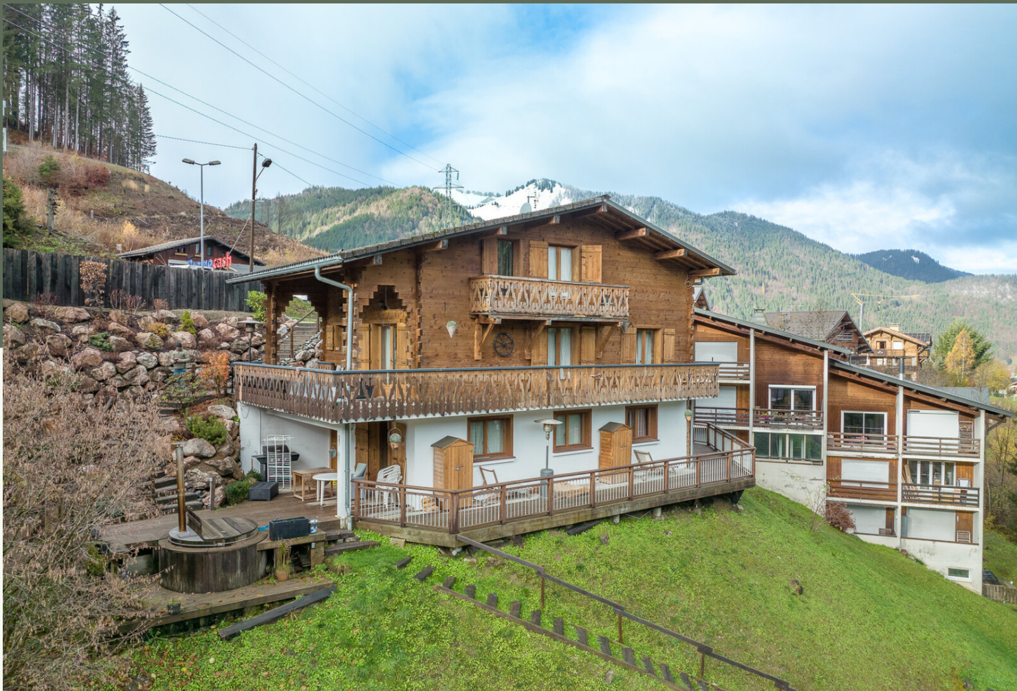
CHALET 6 ROOMS - MOUNTAIN/VILLAGE VIEW · MORZINE