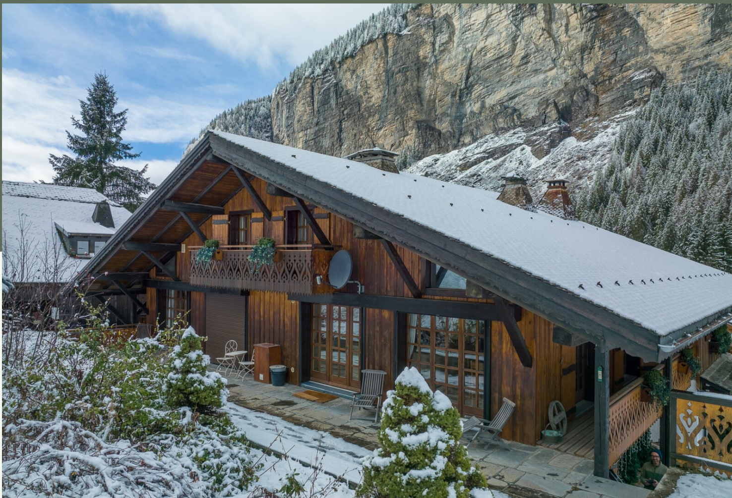
CHALET 13 ROOMS - QUIET AREA · MORZINE