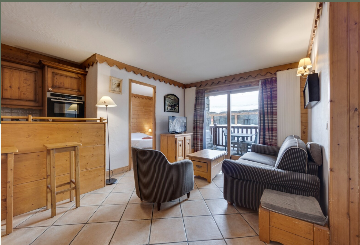
3-BEDROOMS APARTMENT IN TIGNES VAL CLARET · TIGNES