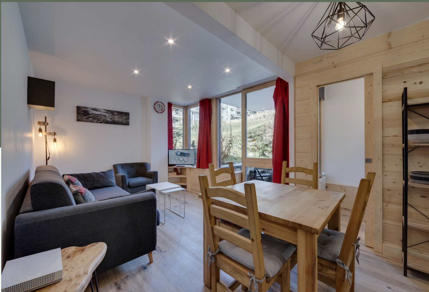
1-BEDROOM APARTMENT + CABIN COMPLETELY RENOVATED · TIGNES