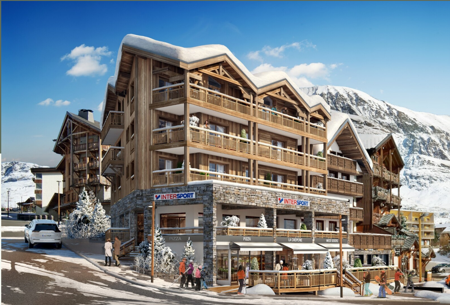
TOP FLOOR WITH CATHEDRAL LIVING ROOM · ALPE D'HUEZ