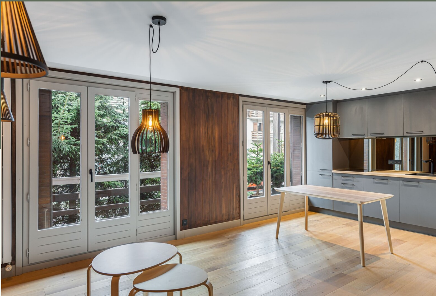
RENOVATED 3-BEDROOM APARTMENT - NEAR THE VILLAGE CENTRE . MEGÈVE