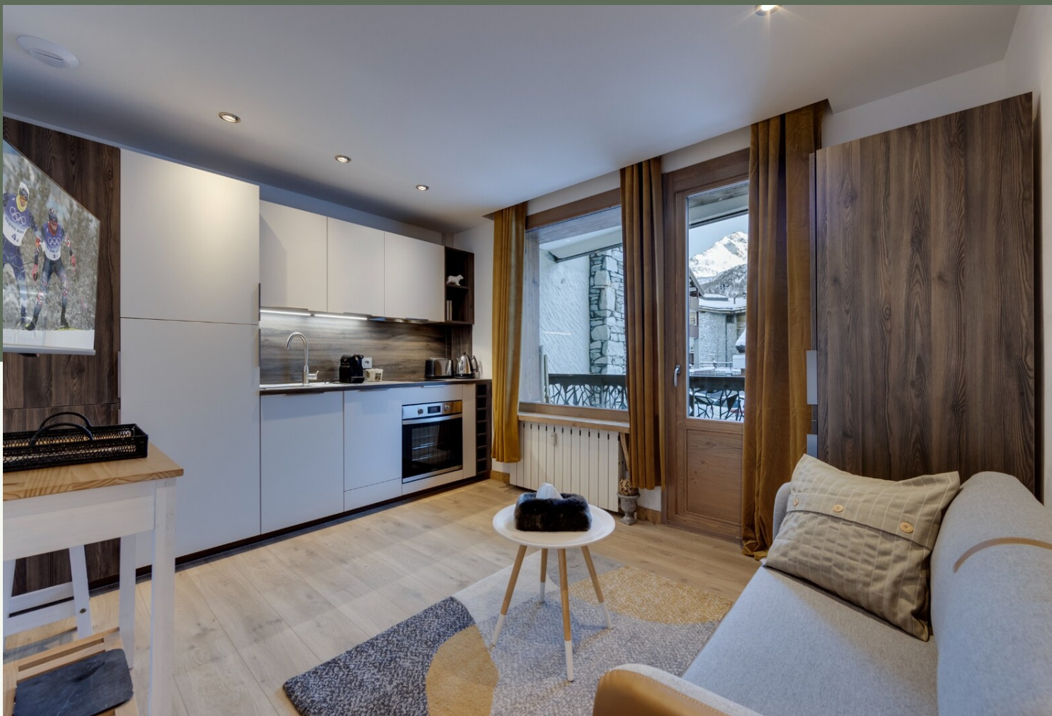
CHARMING 2-ROOM NEAR THE CENTER · VAL-D'ISÈRE