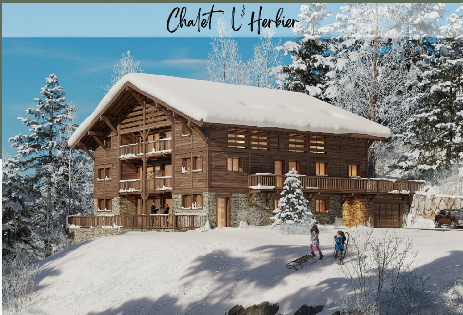
SPACIOUS FIVE-ROOM APARTMENT WITH OPEN VIEWS - L'HERBIER • MANIGOD