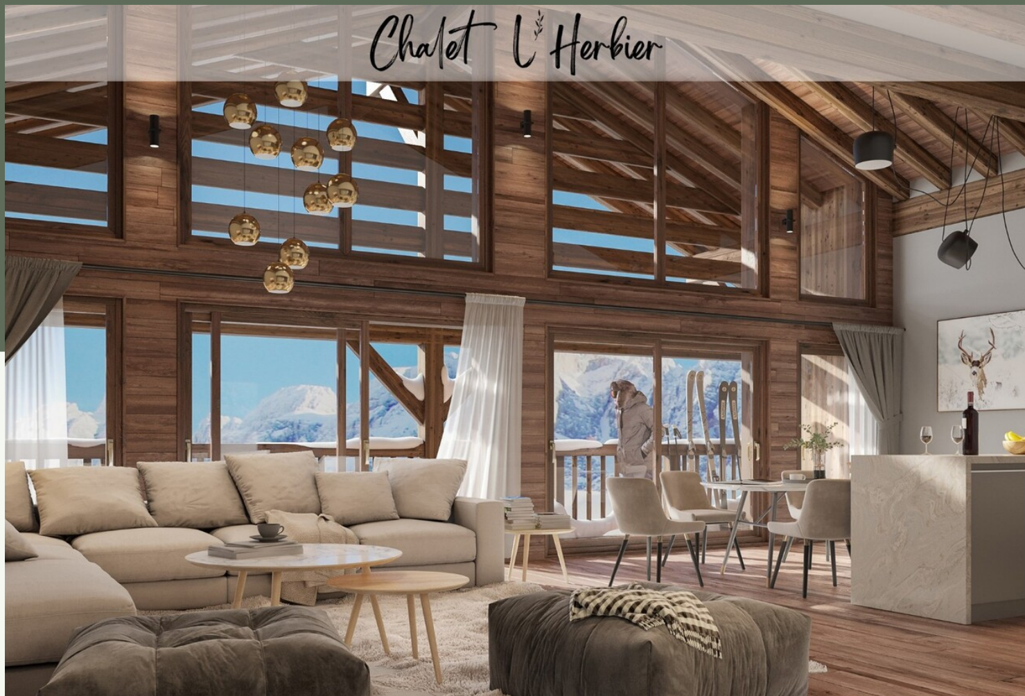
4 ROOM APARTMENT WITH GOOD EXPOSURE - L'HERBIER · MANIGOD