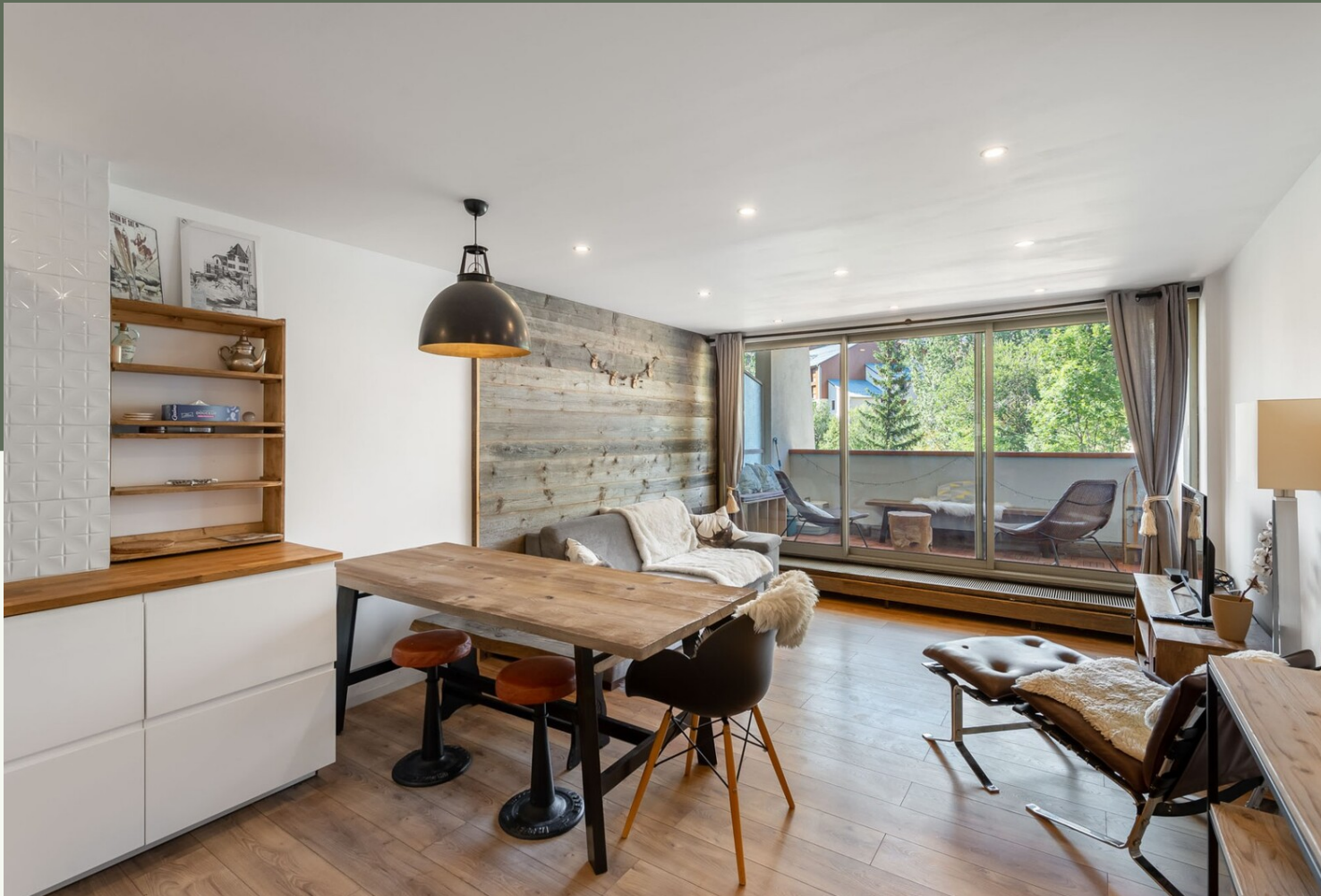
1-BEDROOM APARTEMENT - SOUTH FACING · COURCHEVEL MORIOND