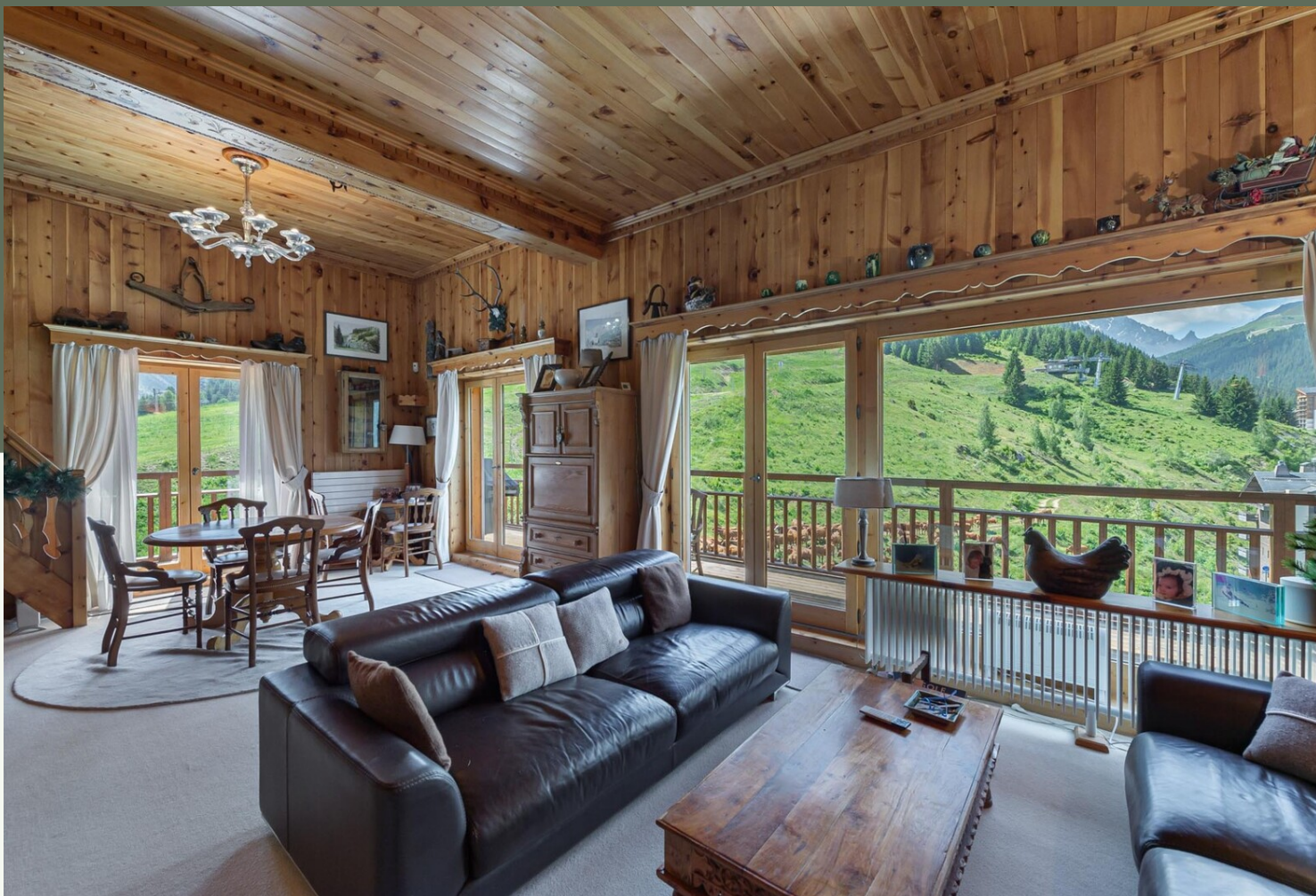
4 BEDROOMS APARTMENT IN RESORT CENTRE · COURCHEVEL MORIOND