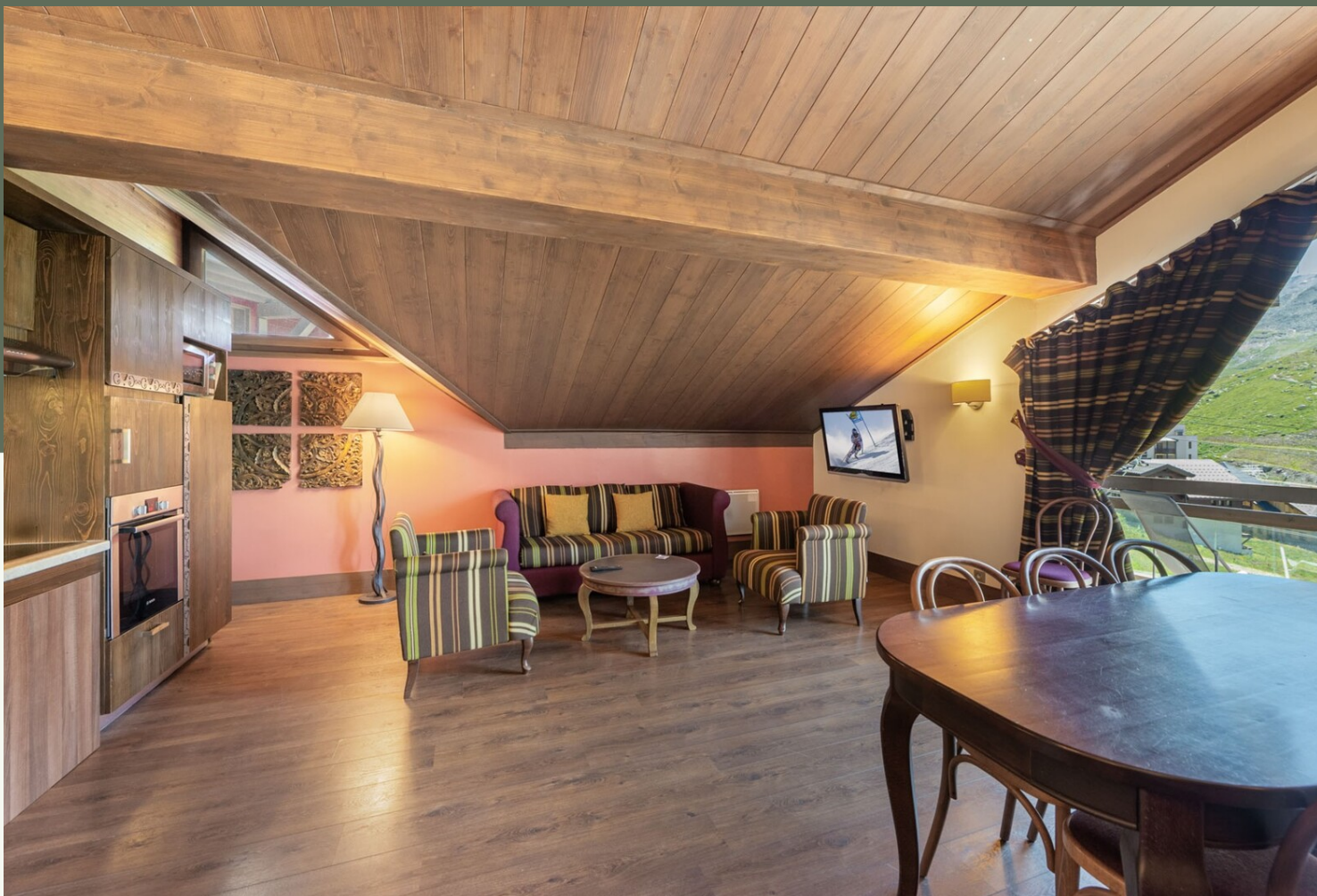
MAGNIFICENT APARTMENT IN A 4* HOTEL RESIDENCE · VAL THORENS