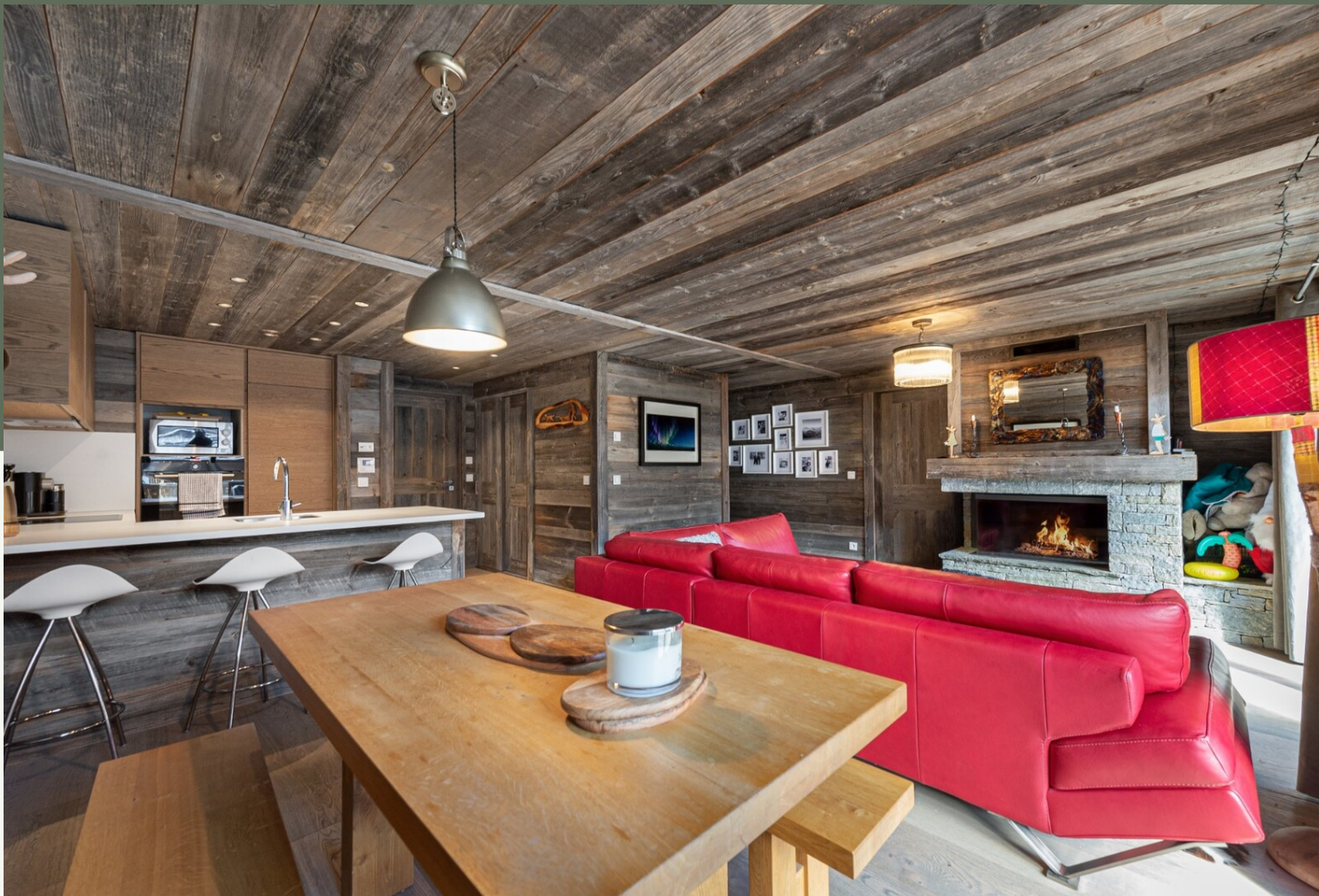
NEW BUILT FLAT WITH BIG TERRASSE · MERIBEL VILLAGE