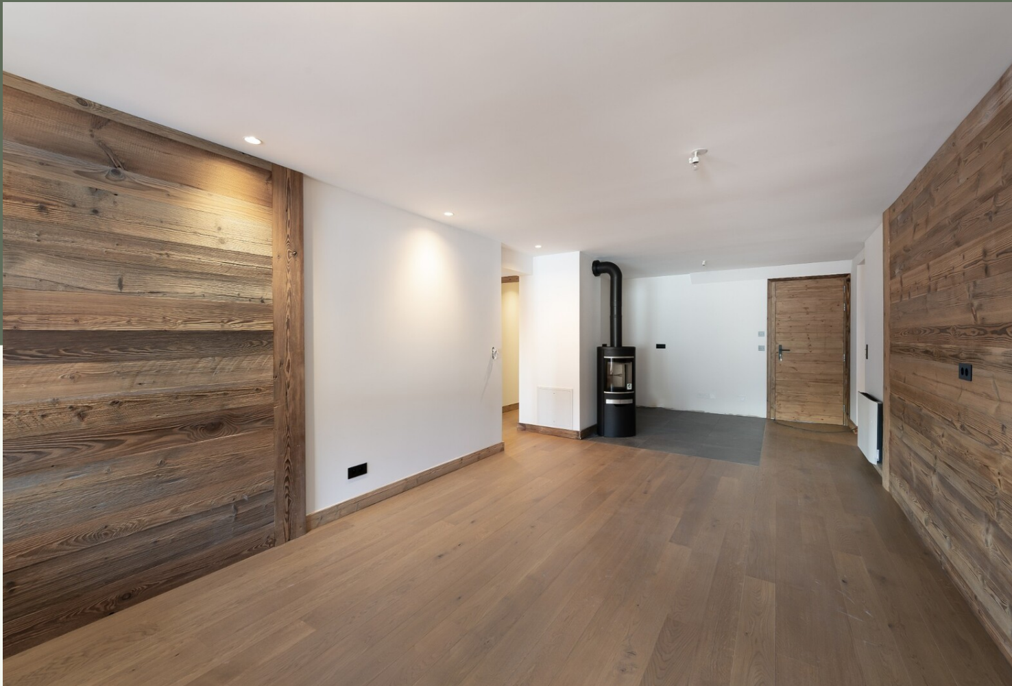
NEW APARTMENT - 4 BEDROOMS - SKI IN SKI OUT · SAINT-MARTIN-DE-BELLEVILLE