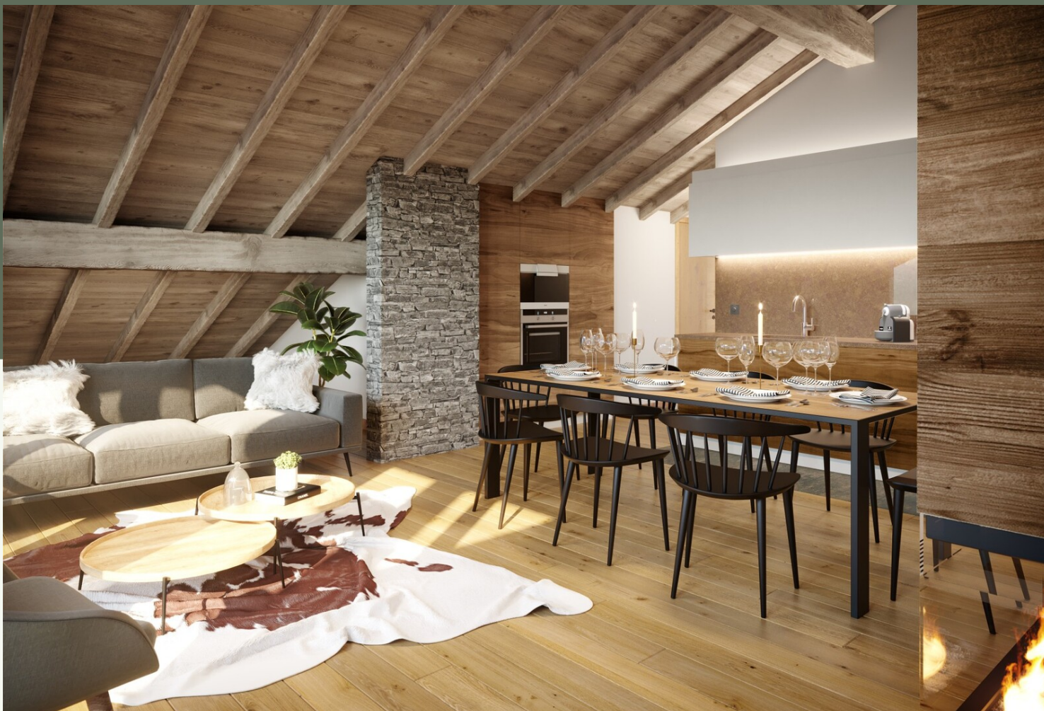
ATYPICAL 3 BEDROOMS IN THE NEW PROGRAMME LES FERMES DE L'ALPE · ALPE D'HUEZ