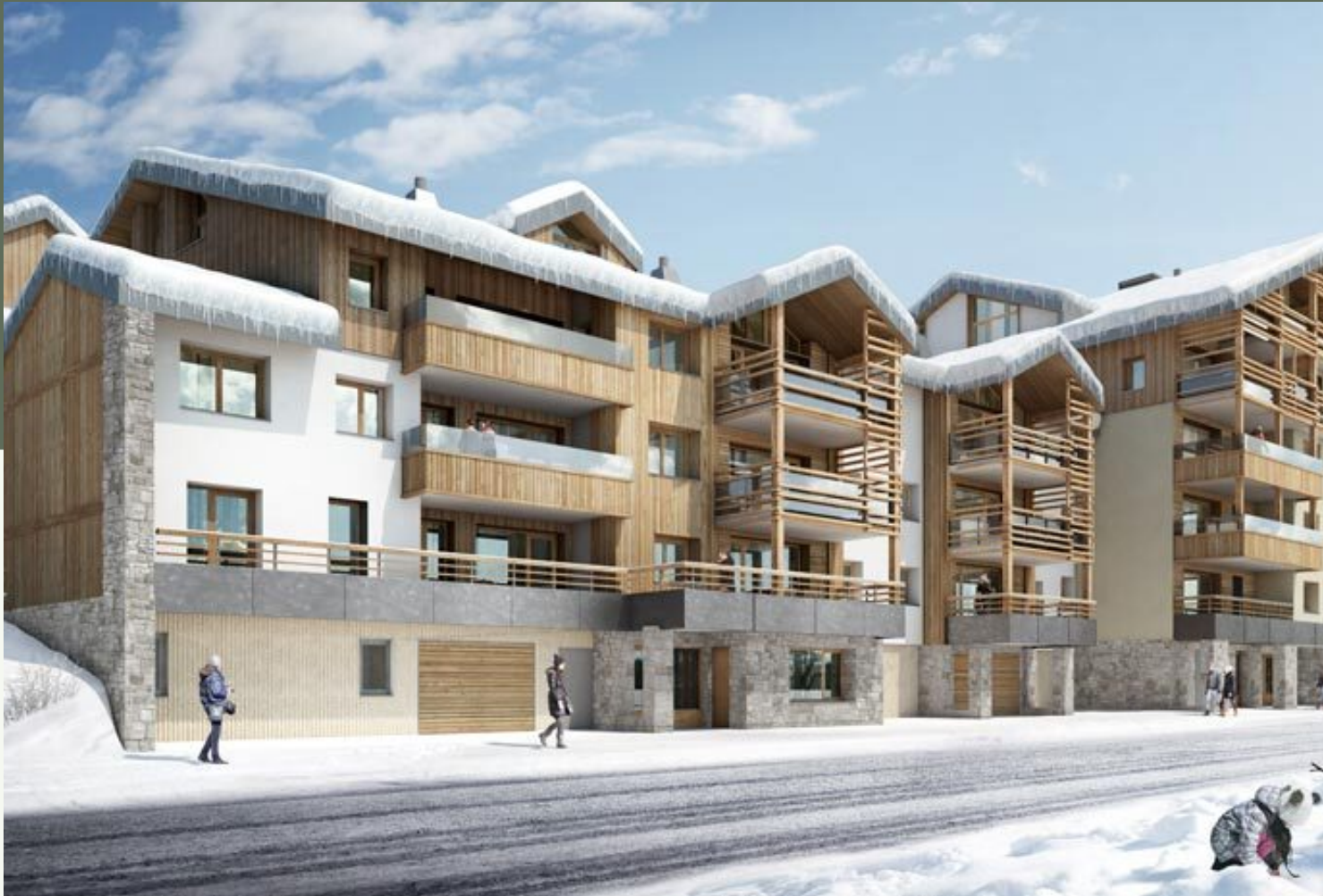
4 BEDROOMS IN NEW PROGRAMME NEUF LES FERMES DE L'ALPE . ALPE D'HUEZ