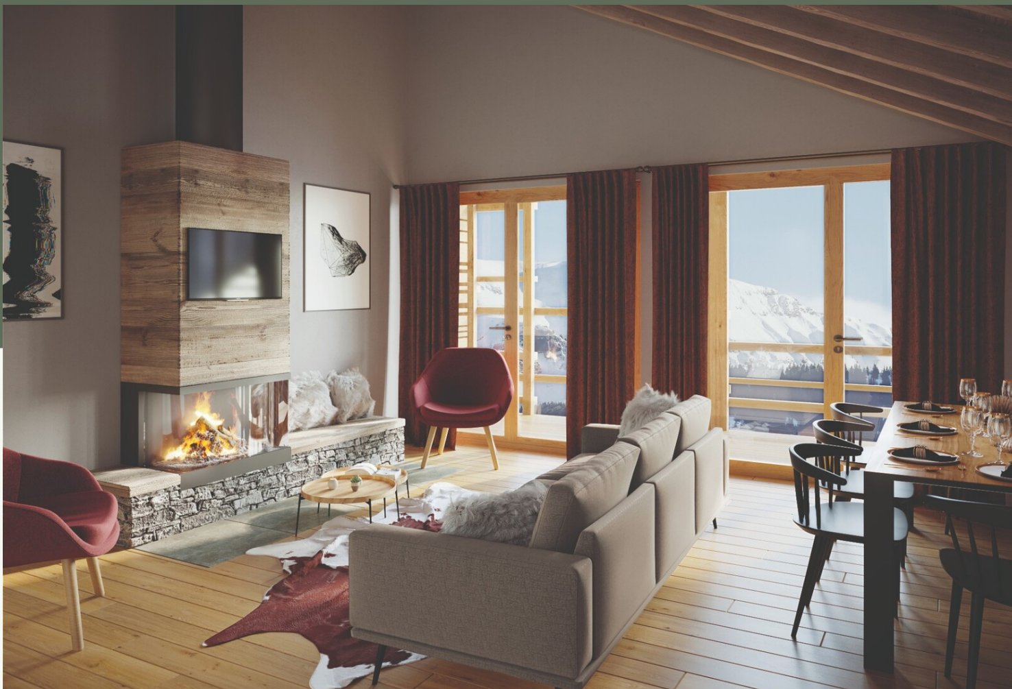
SUPERB 3 BEDROOMS APARTMENT IN THE NEW PROGRAMME LES FERMES DE L'ALPE · ALPE D'HUEZ