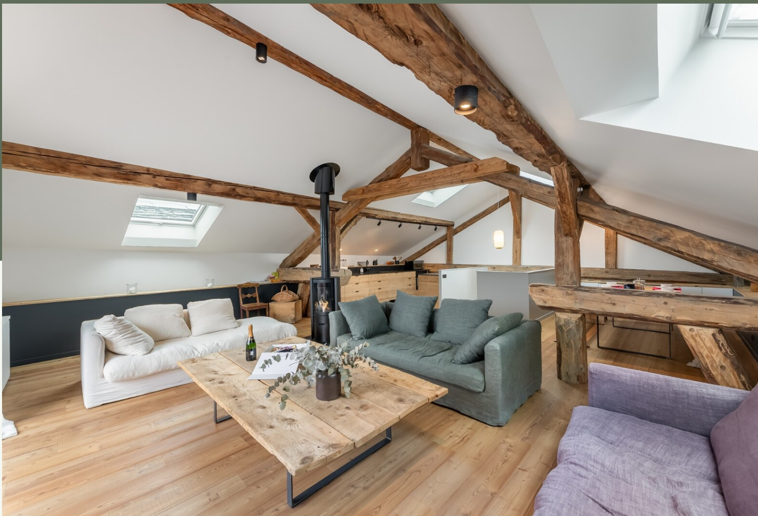
RENOVATED CHALET - 4 BEDROOMS - HEART OF THE VILLAGE · SAINT-MARTIN-DE-BELLEVILLE